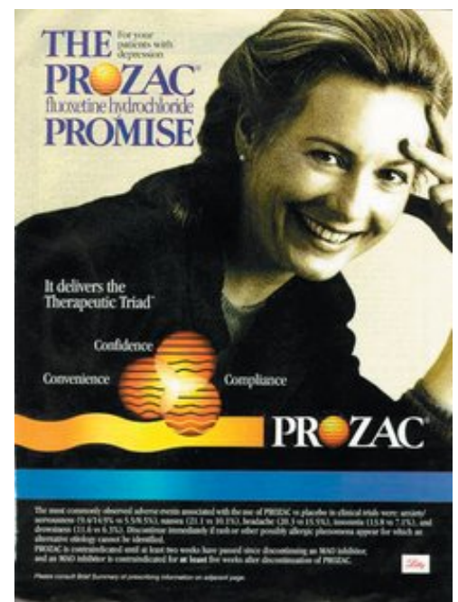
An advertisement for Prozac, from The American Journal of Psychiatry, 1995

It seems that Americans are in the midst of a raging epidemic of mental illness, at least as judged by the increase in the numbers treated for it. The tally of those who are so disabled by mental disorders that they qualify for Supplemental Security Income (SSI) or Social Security Disability Insurance (SSDI) increased nearly two and a half times between 1987 and 2007—from one in 184 Americans to one in seventy-six. For children, the rise is even more startling—a thirty-five-fold increase in the same two decades. Mental illness is now the leading cause of disability in children, well ahead of physical disabilities like cerebral palsy or Down syndrome, for which the federal programs were created.